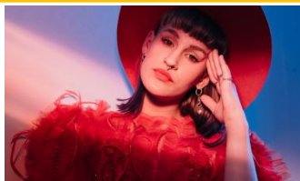
Czechia Aiko - Pedestal